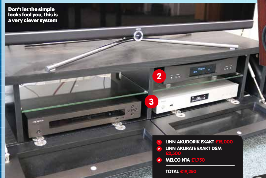
Don't let the simple looks fool you, this is a very clever system

It knows how to groove too. The funky fifties-style swing rock of Eileen Jewell's Queen Of The Minor Key is presented with electrifying energy and punch. Where the Exakt technology really comes into its own is that once you're content with what it does, it allows you to achieve antisocial levels without the slightest sign of strain or stress. Regardless of your requirements, it seems to have an inexhaustible supply of power to deliver on your requirements whatever they are.