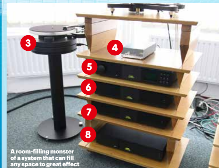
A room-filling monster of a system that can fill any space to great effect

Nobody Speak by DJ Shadow is a ballistic, organ jarring, shouting monster of a track, but this system simply rolls up its sleeves and delivers every crunching beat and machine gun lyric without showing any sign of strain. I've had the Sopra No2 in my own room in the past and didn't feel for a second that it ever needed any bass augmentation, but having heard it like this, I'd be tempted even if it's akin to using a hand grenade to win at conkers.